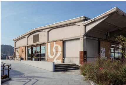
ONOMICHI U2 Design by Suppose Design Office