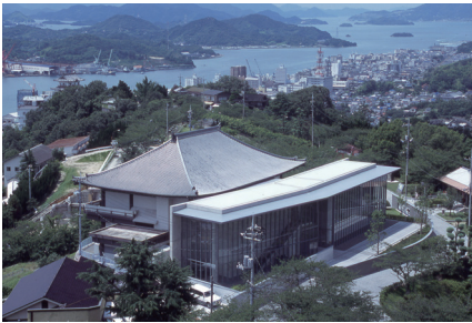
Onomichi City Museum of Art Design by Tadao Ando

Symbol Mark, Logotype Design: Kenya Hara