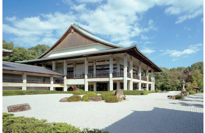
Shinshoji Zen Museum and Gardens in Fukuyama City (Mumyoin)

Name: Kenzo Tange's Residence Reconstruction Project Venue: Shinshoji Zen Museum and Gardens (within the Mumyoin Main Hall)