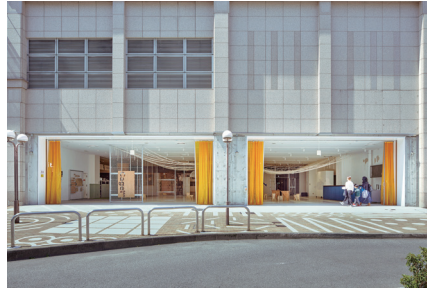
iti SETOUCHI