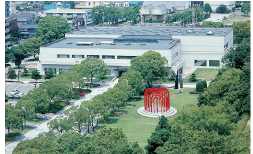
Fukuyama Museum of Art

*The Fukuyama Museum of Art exhibition will be held within the Civic Gallery.