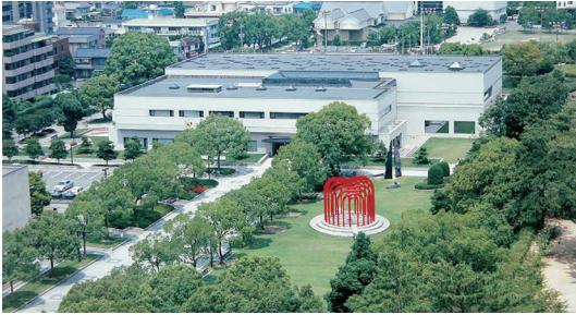
Fukuyama Museum of Art