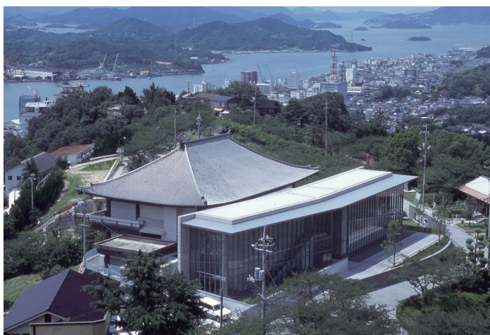
Onomichi City Museum of Art

Participating architects: Eight architectural groups (consisting of nine individuals) who have won the Pritzker Architecture Prize: Kenzo Tange (awarded in 1987), Fumihiko Maki (1993), Tadao Ando (1995), Kazuyo Sejima and Ryue Nishizawa (2010), Toyo Ito (2013), Shigeru Ban (2014), Arata Isozaki (2019), and Riken Yamamoto (2024).