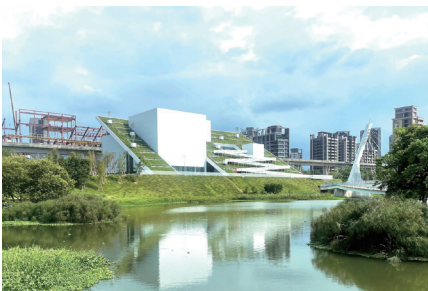
Taoyuan Children Art Center Design by Riken Yamamoto ©Riken Yamamoto & Field Shop