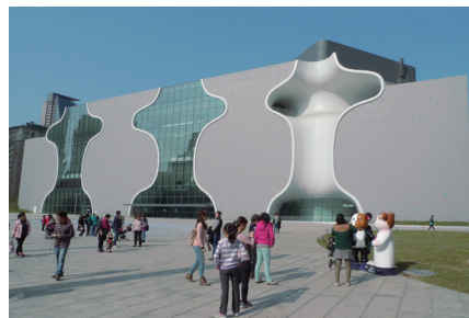
National Taichung Theatre (Taiwan) Design by Toyo Ito ©Toyo Ito & Associates, Architects