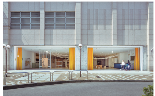
iti SETOUCHI

For example, at iti SETOUCHI in Fukuyama City, architects will introduce their visions of the city of the future.