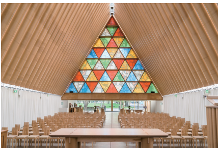
Christchurch Cardboard Cathedral (New Zealand) Design by Shigeru Ban