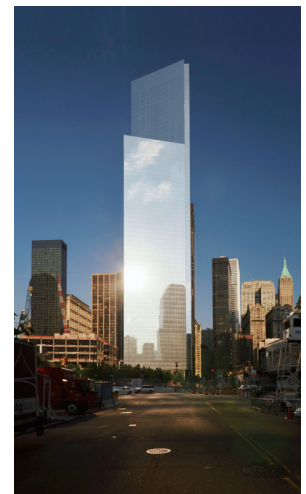
4 World Trade Center (USA) Design by Maki and Associates