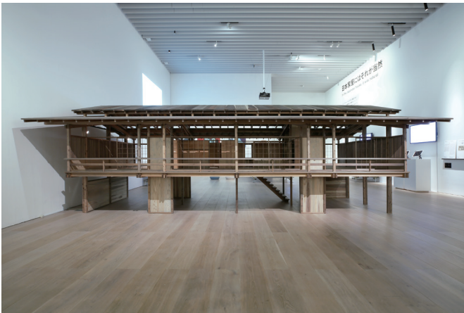
A House (Tange Kenzo House) Design: Tange Kenzo 1953 (demolished) Model: 1:3 2018 W6790 D3440 H2215 Supervisor: Mori Art Museum, Noguchi Naoto Production: Odawara Meikosha Installation view: "Japan in Architecture: Genealogies of Its Transformation," Mori Art Museum, Tokyo, 2018