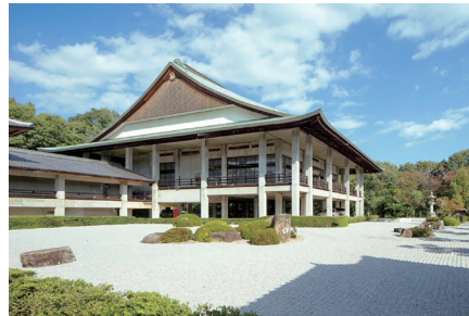
Shinshoji Zen Museum and Gardens in Fukuyama City (Mumyoin)