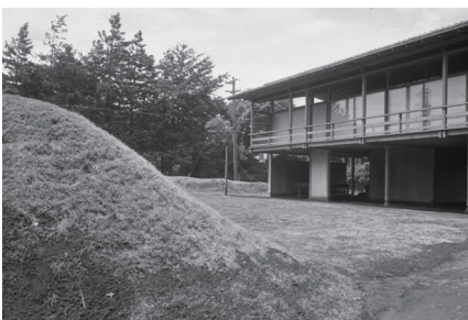
Kenzo Tange Residence

*For images of Kenzo Tange's residence, please submit the attached "Image Usage Application Form" with a signature.