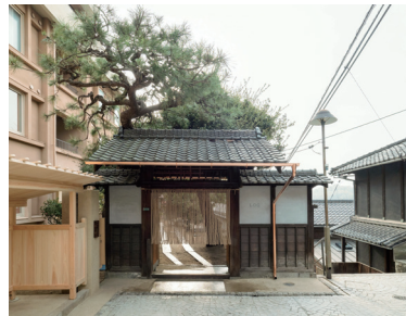
LOG Design by Studio Mumbai