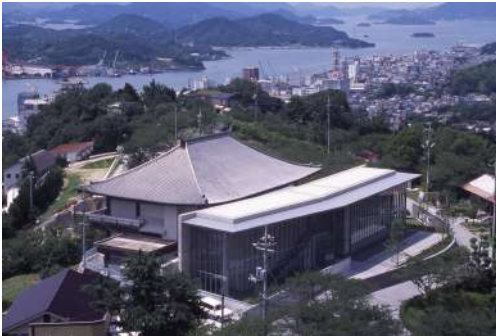
Onomichi City Museum of Art