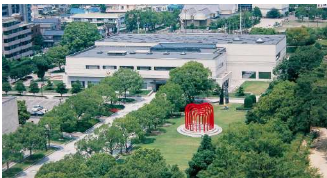
Fukuyama Museum of Art