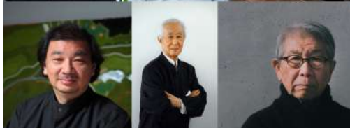
From left: Shigeru Ban Arata Isozaki Riken Yamamoto