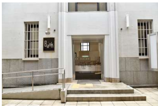
Machinaka Cultural Exchange Center “Bank”