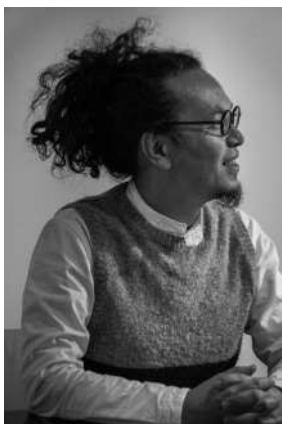
Jo Nagasaka

Participating Architects: Jo Nagasaka + Schemata Architects