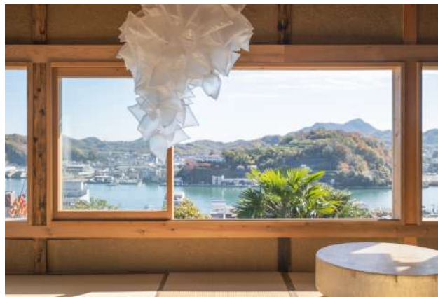
LLOVE HOUSE ONOMICHI