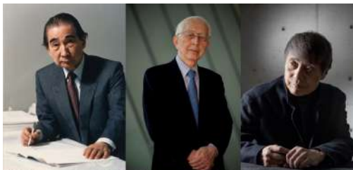
From left: Kenzo Tange / Maki Fumihiko / Tadao Ando

Kenzo Tange (awarded in 1987), Fumihiko Maki (1993), Tadao Ando (1995), Kazuyo Sejima and Ryue Nishizawa (2010), Toyo Ito (2013), Shigeru Ban (2014), Arata Isozaki (2019), and Riken Yamamoto (2024).