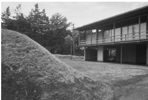
Seijo Villa (Kenzo Tange House) Photo: Kenzo Tange Courtesy of Michiko Uchida