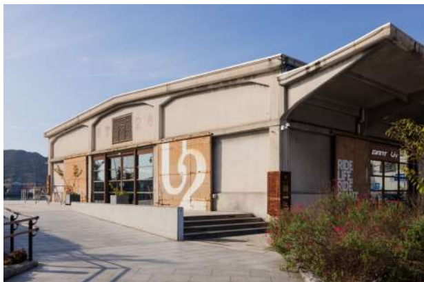
ONOMICHI U2

*Details of other annex venues, related programs, and events will be announced at a later date.