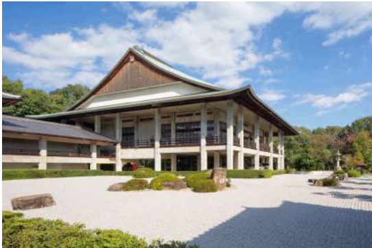
Shinshoji Zen Museum and Gardens