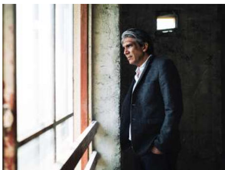
Studio Mumbai/Bijoy Jain

Participating Architects and Artists: Studio Mumbai/Bijoy Jain, UMA/design farm