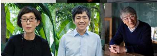
From left: Kazuyo Sejima / Ryue Nishizawa / Toyo Ito